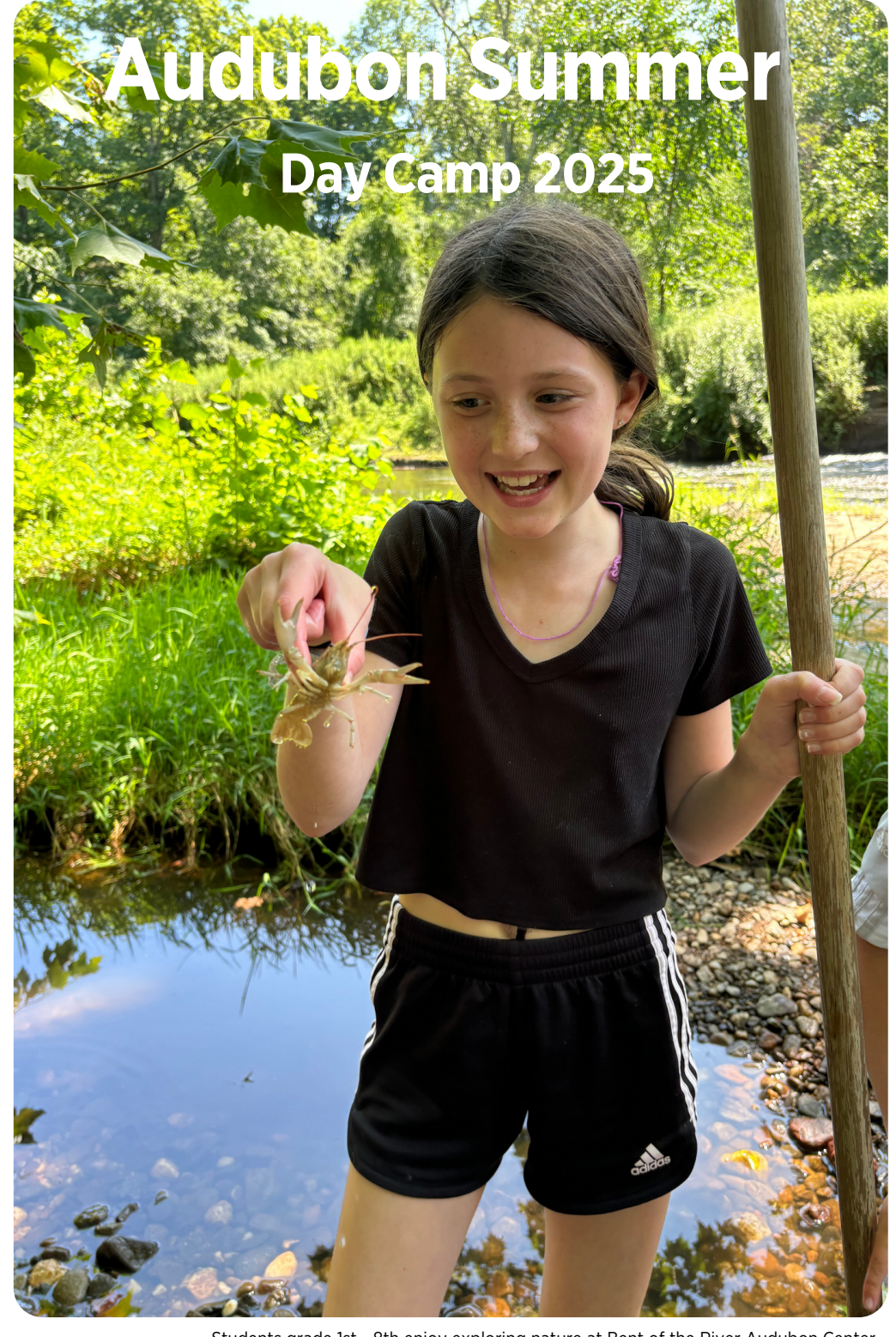
Students grade 1st - 8th enjoy exploring nature at Bent of the River Audubon Center.