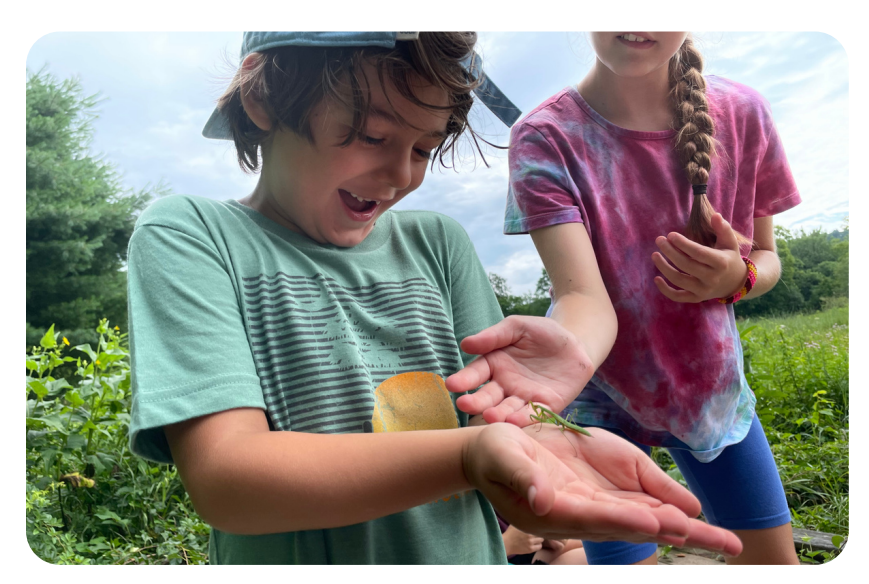
Praying Mantis

Payment (minus 20%) will be refunded for cancellations received at least two weeks before the first day of camp to be attended. If Audubon must cancel a session, you will receive a full refund for that session only. No refunds will be given for cancellations made within two weeks of camp.